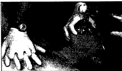
Carbon monoxide poisoning endangers lives.

Local municipal building officials are the best source of information concerning carbon monoxide alarms in new construction.